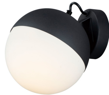
Shown in matte black / satin white

The Half Moon Wall Light features a spun metal semi sphere finished in Metallic Gold or Matte Black, that cap a Satin White glass shade. Installed into each fixture is an omni-directional LED bulb that evenly illuminates the glass while providing long life operation. Maybe installed with glass facing up or down. cUL or ETL listed. Suitable for damp locations. Dimmable with Triac dimmer.