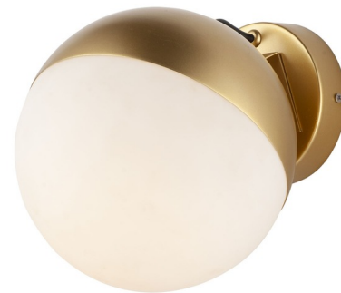
Shown in metallic gold / satin white

LAMP LIFE . . . . . 20000 hours COLOR RENDERING . . . . . 90 CRI LAMP COLOR . . . . . 3000K LUMENS/WATT . . . . . 70.00 LUMINOUS FLUX . . . . . 630 lumens