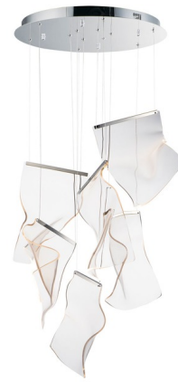
Shown in polished chrome / clear patterned acrylic

PRODUCT DIMENSIONS . . . . . Overall Height: 17in Min. - 133.75in Max. LAMP LIFE . . . . . 25000 hours COLOR RENDERING . . . . . 90 CRI LAMP COLOR . . . . . 3000K LUMENS/WATT . . . . . 300.00 LUMINOUS FLUX . . . . . 900 lumens