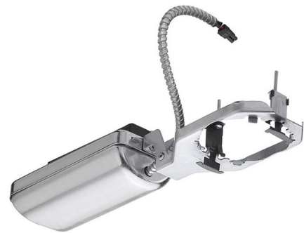
Shown in silver