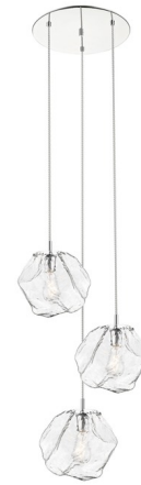
Shown in mirrored stainless steel / clear

The Boulder Multi Light Pendant offers a chic look inspired by nature, featuring three organic shaped Clear glass shades suspended from a Mirrored Stainless Steel finished canopy that also has an organic form. Recommended dimmers: (ELV) Lutron Skylark SELV-300P, (TRIAC) Legrand Titan CD703-PW. Title 20 compliant. UL and cUL listed. Suitable for commercial or residential use.