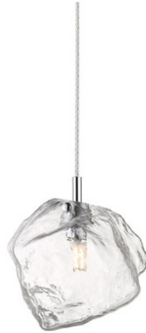
Shown in: Chrome / Clear

The Boulder Pendant offers a chic look inspired by nature, featuring an organic shaped Clear glass shade suspended from a Chrome finished canopy that also has an organic form. Available in two sizes. Title 20 compliant. UL and cUL listed.