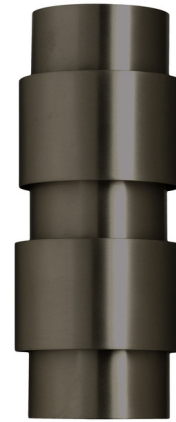
Shown in bronze

The Ring Wall Sconce draws inspiration from chiaroscuro, the effects of strong light and shadows, featuring a silhouette composed of rings of differing size so the light emitted can highlight different aspects and create an overall dramatic, sculptural look. UL listed. Includes 4.5 inch square plate to cover junction box (not pictured).