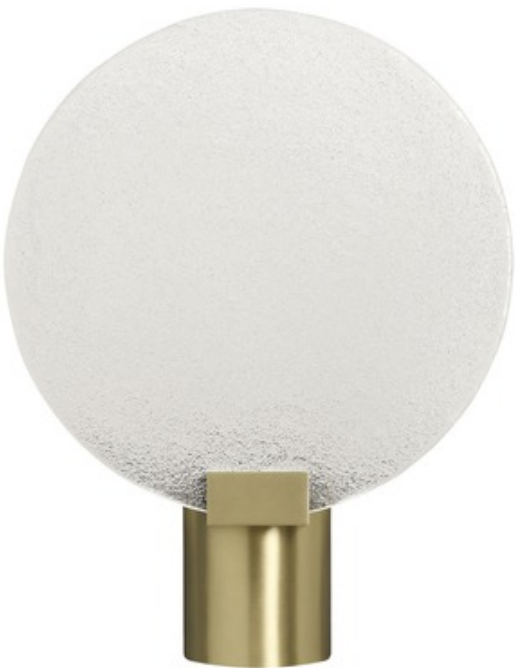
Shown in: Satin Brass

The Nimbus Wall Sconce offers a unique look that blends retro and modern design to together to create a piece that is chic and will suit a number of interiors. Featuring a hand formed glass droplet set into a Satin Brass or Bronze finished wall bracket that conceals the light source. UL listed. ADA compliant. Made in England.