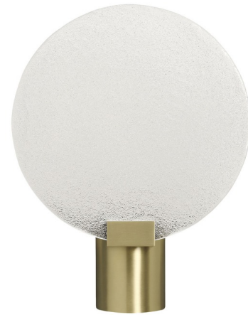
Shown in satin brass / frosted

The Nimbus Wall Sconce offers a unique look that blends retro and modern design to together to create a piece that is chic and will suit a number of interiors. Featuring a hand formed glass droplet set into a metal wall bracket that conceals the light source. UL listed. ADA compliant. Made in England. Includes 4.5 inch square junction box cover (not pictured).