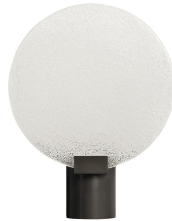
Shown in bronze / frosted

The Nimbus Wall Sconce offers a unique look that blends retro and modern design to together to create a piece that is chic and will suit a number of interiors. Featuring a hand formed glass droplet set into a metal wall bracket that conceals the light source. UL listed. ADA compliant. Made in England. Includes 4.5 inch square junction box cover (not pictured).