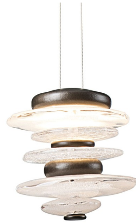
Shown in dark smoke