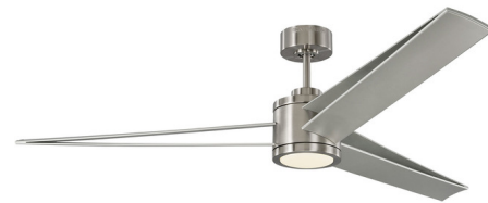
Shown in brushed steel / silver