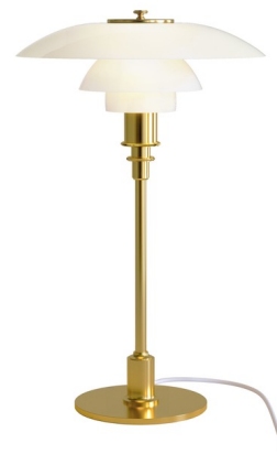
Shown in brass / opal

The PH 3/2 Table Lamp, designed by Poul Henningsen, is based on the principle of a reflective three shade system, which directs the majority of the light downwards. The shades are made of hand-blown opal three layer glass, which is glossy on top and sandblasted matte on the underside, giving a soft light distribution. On/Off switch on cord.