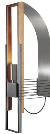
Shown in stainless steel / natural

The Marx Wall Sconce will add intrigue to any interior with its unique silhouette. The sconce's rectangular wooden frame is supported by an arched stainless steel reflector and thin horizontal rods, which provide support and create decorative shadows.