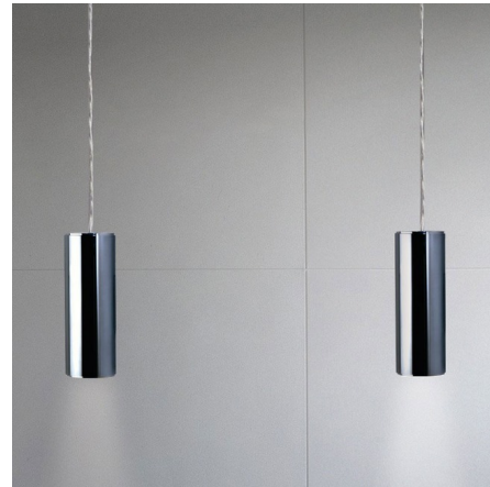
Shown in chrome