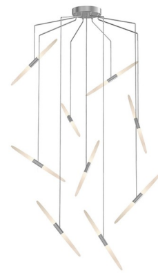
Shown in bright satin aluminum / frosted

COLOR RENDERING . . . . . 90 CRI LAMP COLOR . . . . . 3000K LUMENS/WATT . . . . . 135.12 LUMINOUS FLUX . . . . . 5540 lumens