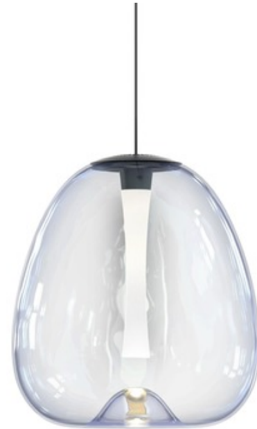
Shown in: Satin Black / Dichroic

The Mela Pendant radiates a sophisticated presence within its space. The Dichroic glass reveals the color of its surroundings within its sensual shape while the Frosted inner tube diffuses the light. The Satin Black finish complements any room perfectly. Available in two sizes. Dimmable via low-voltage electronic or 0-10V dimming. Includes 72 inch cord. Damp location rated. ETL and UL listed.