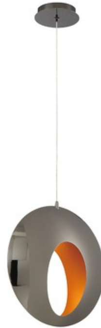
Shown in: Blackened Chrome / Gold

The Arlington Pendant offers a modern look, featuring a Blackened Chrome finished hollowed orb with an open center that reveals a Gold finished interior. ETL listed.