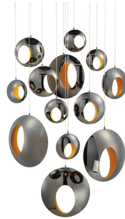
Shown in blackened chrome / blackened chrome

The hollowed orbs suspended on the Arlington Round Chandelier are reminiscent of molten lava, finished in Blackened Chrome and revealing golden interiors illuminated by LEDs. The effortlessly floating design adds dramatic character to your decor. Note: The 51.3 inch width chandelier requires a junction box rated for fixtures weighing over 50 lb.