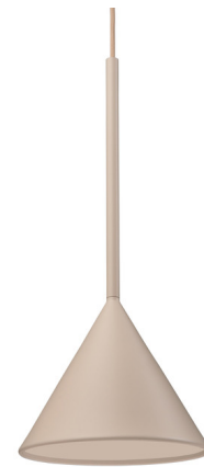
Shown in desert sand

PRODUCT DIMENSIONS . . . . . Adjustable Cord Length: 98.43"