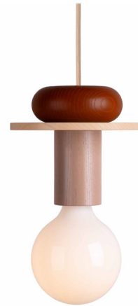
Shown in cream / nougat

PRODUCT DIMENSIONS . . . . . Adjustable Cord Length: 98.43" LAMP COLOR . . . . . 2700K