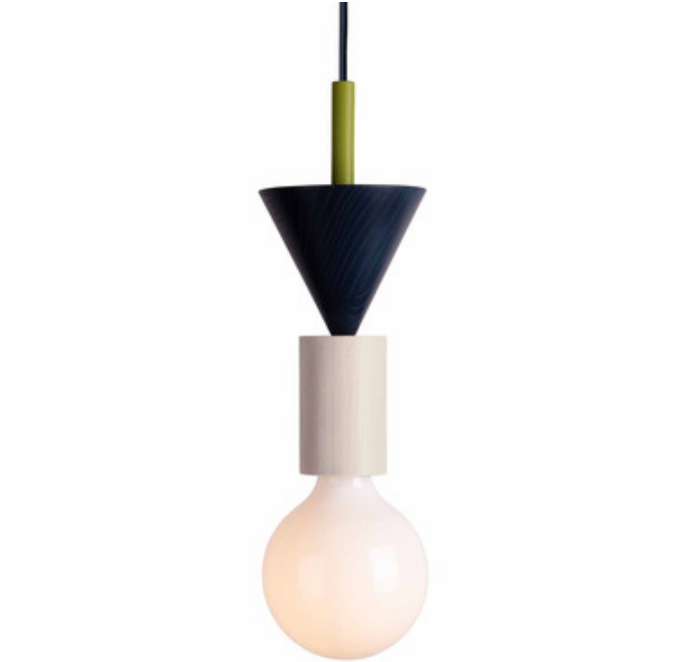
Shown in: Dark Blue / Nougat

Junit Omen Pendant, designed by Julia Jessen, has a minimalist form that is unique in each piece. Turned from high quality natural ash wood and painted in a German workshop. This is perfect alone, or grouped to create your own look. Available with UL listing or non-UL (CE).