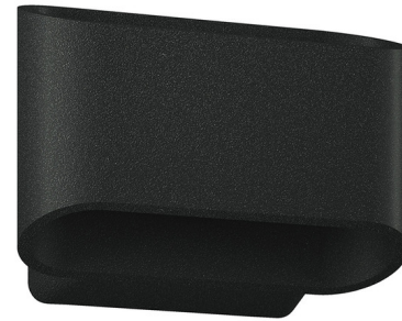
Shown in anthracite

LAMP LIFE . . . . . 50000 hours COLOR RENDERING . . . . . 90 CRI LAMP COLOR . . . . . 3000K LUMENS/WATT . . . . . 61.08 LUMINOUS FLUX . . . . . 1130 lumens