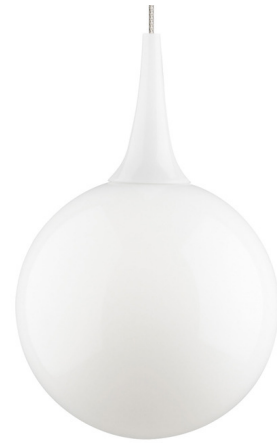
Shown in satin nickel / white

Pele Monopoint Pendant features a mid-century modern spherical design with a funneled White glass detail with Satin Nickel finish. Available with halogen and LED lamp options. Supplied with six feet of field-cutttable suspension cable and a 4 inch round canopy with transformer included. ETL listed. LED option T20/T24 compliant. Halogen option: T20 compliant.