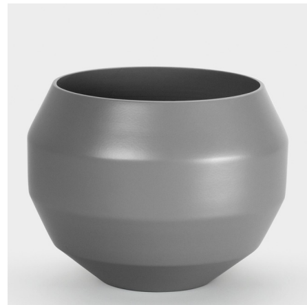
Shown in gray

Pitch Planter has a simple yet strong silhouette, making this perfect in any area of your home. Handmade from banded spun aluminum poised on an internal dome, the bands create varying tonal stripes of color. Fill or leave empty to create your own personal style. Available in White and Grey in two sizes. Made in the UK.