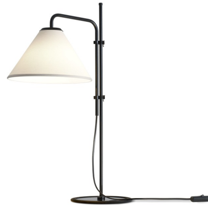
Shown in black / white

Funiculi Shade Table Lamp designed by Lluís Porqueras, is simplistic and functional, perfect in any room of your home. The mechanism for raising and lowering the lamp uses a pair of clips which make the height of the shade adaptable to any user's needs. Available with a Sand or White fabric shade and Black finish. UL listed.