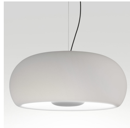
Shown in black / white

The Vetra Pendant could be no more than a traditional, old-fashioned, blown-glass lamp on first impressions, but turning it on yields a surprise. A completely closed matte finish blown glass diffuser as a reflector that creatively places the light source outside -instead of inside- the shade. This gives off more light than one would expect, without glare. Much of the light is directed downward, and the rest is filtered toward the inside of the shade, subtly illuminating it. Like an echo multiplying the light, when it's on, its entire outline is drawn out and seems to come alive.