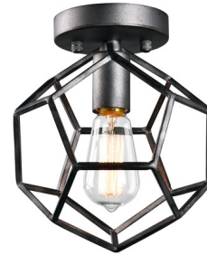
Shown in rusty black

Geometry Flush Ceiling Light brings bold geometric lines and crisp edges to this piece. Its simplicity makes it perfect in any room of your home. Bare bulbs are surrounded by a Rusty Black finished cage.