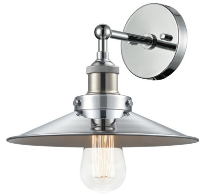
Shown in chrome / chrome

Bulstrode's Workshop Shade Wall Light has the classic lines of an iconic vintage design. Rooted in industrial decor, the Bulstrode incorporates detailed hardware and the beauty of an exposed bulb. Place the Bulstrode over a bedside table, throughout the hallway, or any place where layered lighting is needed.