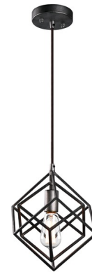
Shown in rusty black

COLOR . . . . . N/A BODY FINISH . . . . . Rusty Black WATTAGE . . . . . 100W DIMMER . . . . . Standard 120V DIMENSIONS . . . . . 42"L x 11.5"W x 11.5"H BULB NOT INCLUDED . . . . . 1 x Edison/Medium (E26)/100W/120V Incandescent