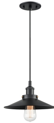
Shown in black / black

Bulstrode's Workshop Shade Pendant has the classic lines of an iconic vintage design. Rooted in industrial decor, the Bulstrode incorporates detailed hardware and the beauty of an exposed bulb. Place Bulstrode over the dining table, kitchenette, hallway, or anyplace where layered lighting is needed.