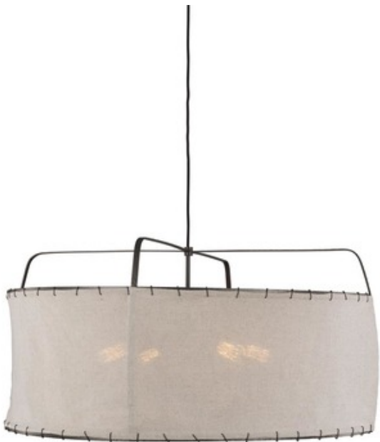
Shown in: Aged Iron / Natural

Dunne Drum Pendant brings a rustic and whimsical feel to any room in your home. Features a Natural linen shade with an Aged Iron finish. The Aged Iron finish is considered a living finish and will develop an increasingly beautiful patina over time. Canopy: 5 inch diameter. Damp location rated. ETL listed.