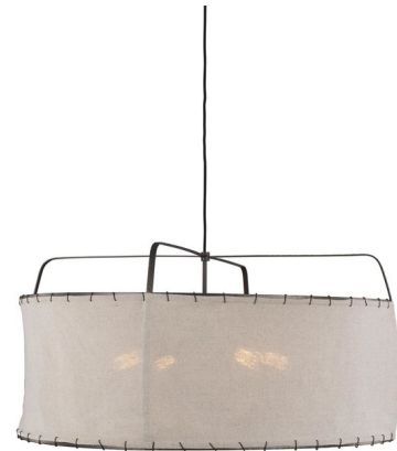
Shown in aged iron / natural

PRODUCT DIMENSIONS . . . . . Adjustable Cable Length: 180"