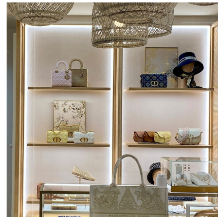
Shown in satin aluminum / diffused lens

COLOR Diffused Lens BODY FINISH Satin Aluminum WATTAGE N/A DIMMER N/A DIMENSIONS 24"L x 0.7"W x 0.35"H BULB N/A