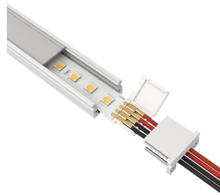
Shown in satin aluminum / diffused lens