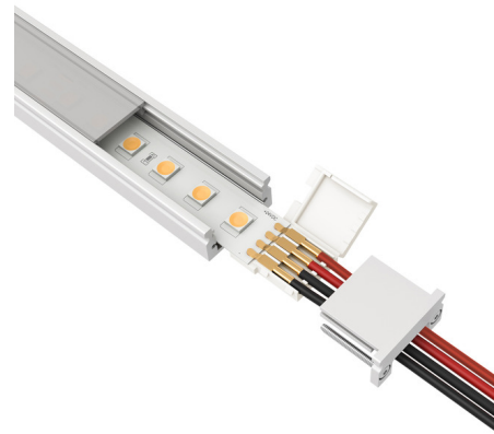
Shown in satin aluminum / diffused lens