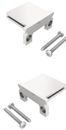
Shown in satin aluminum

End Caps are sold in pairs and provide a finished look at the end of a run as well as hold the required power connector. Typically one order of end caps per run will suffice; however additional end caps may be required if the lighting design requires cutting the channel. Finish: Satin Aluminum. Sold as a pair. Compatible with PureEdge Lighting Light Channel LCS.3 Surface Mount product.