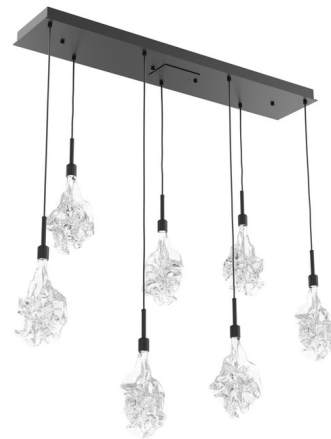
Shown in matte black / clear