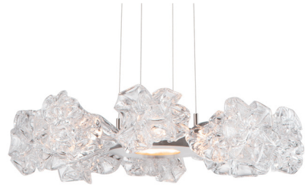
Shown in beige silver / clear