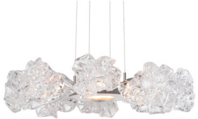
Shown in: Metallic Beige Silver / Clear

The Blossom Ring Chandelier features blossoms of LED lit hand blown glass that are meticulously crafted by Hammerton artisans. The fixture is a whimsical celebration of organic aesthetic that exudes casual sophistication. The glass blossoms take the place of a traditional bulb and unfolds with striking illumination. The finished look is relaxed, soft and unique. Each glass shade is a one of a kind artisan creation. Available in three sizes. Canopy: 6.7/7.7/11.5 inch diameter.