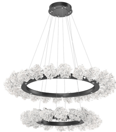
Shown in matte black / clear