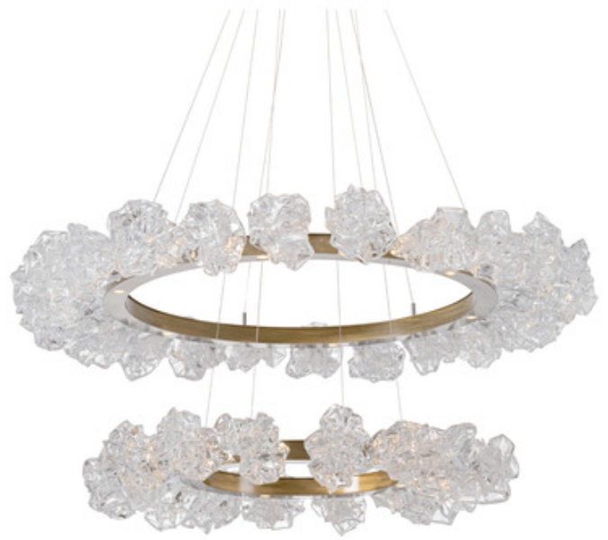
Shown in: Heritage Brass / Clear

The Blossom Two Tier Ring Chandelier features blossoms of LED lit hand blown glass that are meticulously crafted by Hammerton artisans. The fixture is a whimsical celebration of organic aesthetic that exudes casual sophistication. The glass blossoms take the place of a traditional bulb and unfolds with striking illumination. The finished look is relaxed, soft and unique. Each glass shade is a one of a kind artisan creation. Canopy: