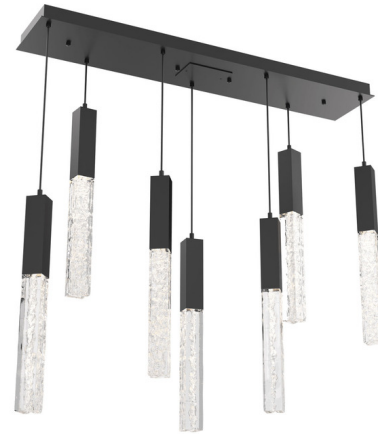
Shown in matte black / clear

PRODUCT DIMENSIONS . . . . . Max Overall Height: 144" COLOR RENDERING . . . . . 93 CRI LAMP COLOR . . . . . 2700K LUMENS/WATT . . . . . 614.10 LUMINOUS FLUX . . . . . 2395 lumens