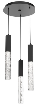
Shown in matte black / clear

PRODUCT DIMENSIONS . . . . . Min/Max Adjustable Length: 27" - 144" COLOR RENDERING . . . . . 93 CRI LAMP COLOR . . . . . 2700K LUMENS/WATT . . . . . 256.75 LUMINOUS FLUX . . . . . 1027 lumens