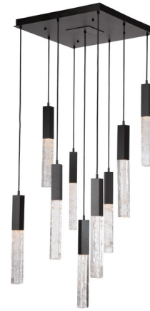
Shown in matte black / clear