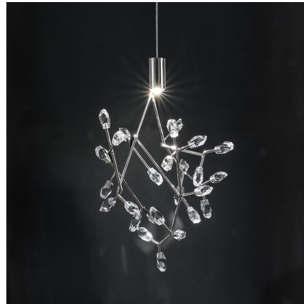
Shown in nickel / crystal

Core Crystal Pendant, designed by Christian Lava, is reminiscent of the natural energy at the heart of our world. Like bright lava seeping through the Earth's crust, vibrant spheres of faceted Crystal break through the finish, creating a powerful, vibrant exchange of shadows and light that erupt across the room.