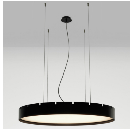
Shown in matte black / opal

The Castle Pendant is an aluminum suspension lamp that provides direct light with a soft, indirect light effect, featuring a circular body accented with a turret-inspired top edge, with an Opal White PMMA bottom diffuser. Available in three sizes finished in Matte White, Matte Black, or Natural Oak. CE and cUL listed.