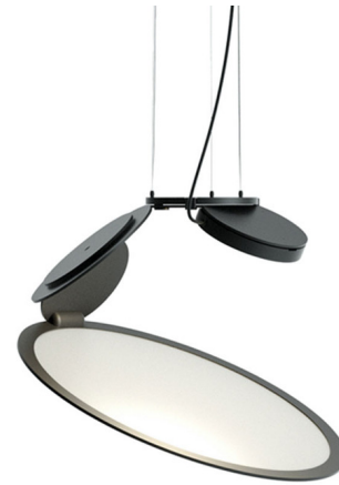
Shown in intense black