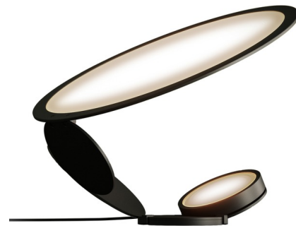
Shown in intense black

BEAM ANGLE . . . . . 60° COLOR RENDERING . . . . . 90 CRI LAMP COLOR . . . . . 3000K LUMENS/WATT . . . . . 80.94 LUMINOUS FLUX . . . . . 1376 lumens