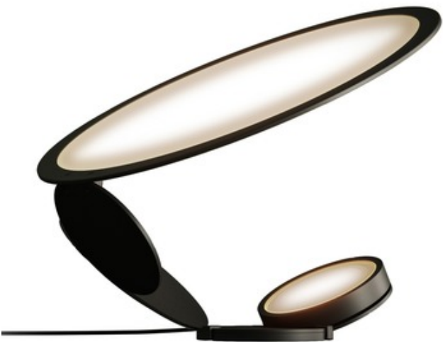
Shown in: Intense Black

The Cut Table Lamp offers a sleek, modern look characterized by an intriguing composition of adjustable components held into a laser-cut aluminum structure. This creates a unique lighting effect, where the light source embedded in a circular metal support, faces a semi-transparent diffuser disk to filter and reflect the light. Finished in Intense Black. On/off switch on cord.