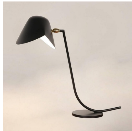
Shown in black

The Antony Table Lamp offers a sleek look, featuring a slender sloping arm set into a round base that extends out with an angled shade attached with a Brass swivel to allow the shade to be re-positioned. Finished in Black. UL listed.