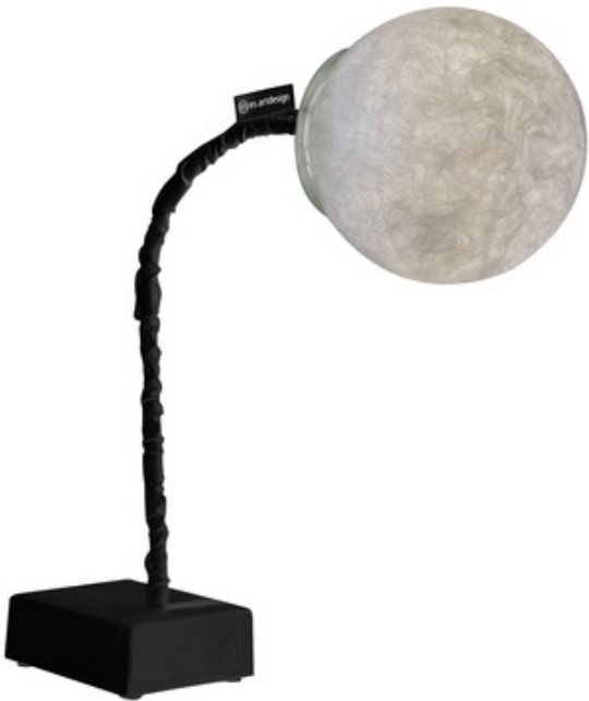
Shown in: Black / White

Luna Micro T Table Lamp is inspired by the moon's mysteries. The globe shaped shade is constructed of Nebulite, a specially developed material made of resins and fibers, that mimics the uneven, softly luminescent qualities of the moon's surface. Available with a White shade and a Black or White finish. Includes a 6.5 foot cord and switch. Handmade in Rome, Italy.