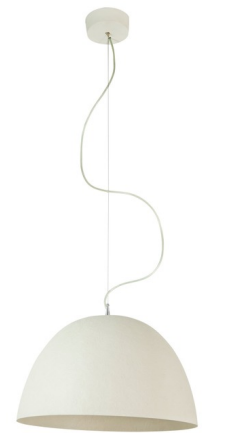
Shown in white / white

COLOR . . . . . White BODY FINISH . . . . . White WATTAGE . . . . . 13W DIMMER . . . . . Standard 120V DIMENSIONS . . . . . 51"L x 18.11"W x 10.8"H BULB NOT INCLUDED . . . . . 1 x A19/Medium (E26)/13W/120V LED