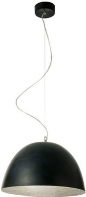
Shown in: Black / Silver

Luna H2O Pendant is inspired by the moon's mysteries. Constructed of Nebulite, a specially developed material made of resins and fibers, that mimics the uneven, softly luminescent qualities of the moon's surface. Features a Black or White outer shade and canopy with a lining in Silver, Bronze, Blue, Magenta, Gold, Orange, Turquoise, Red, or White which casts a please glow on any surface. Includes 4 feet of cable to customize length. Handmade in Rome, Italy.