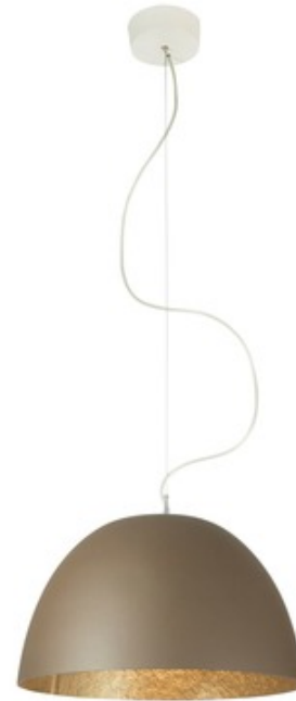
Shown in: Bronze / Gold

Luna H2O Bronze Pendant is inspired by the moon's mysteries. Constructed of Nebulite, a specially developed material made of resins and fibers, that mimics the uneven, softly luminescent qualities of the moon's surface. Features a Bronze outer shade with a lining in Gold which casts a pleasant glow on any surface. Includes 4 feet of cable to customize length. Handmade in Rome, Italy.