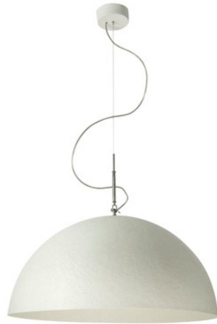
Shown in: White / White

Luna Mezza Luna Nebulite Pendant is inspired by the moon's mysteries. Constructed of Nebulite, a specially developed material made of resins and fibers, that mimics the uneven, softly luminescent qualities of the moon's surface. Features a half moon shade in White, Red, Orange, Turquoise, Magenta, or Blue which casts a pleasant glow on any surface. Available in two sizes. Handmade in Rome, Italy. CE and ETL listed.